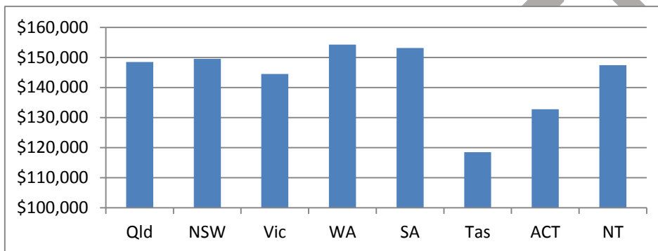
Figure 2.2 – Comparison of levels of base salary across Australian States and Territories as at 1 January 2015

The discussion above reflects the current salary levels. It is expected that nearly all of the comparative jurisdictions will review or make changes to their respective base salary during 2015. In the case of South Australia changes to base salary are tied to the base salary of a Commonwealth MP, while in the Northern Territory the base salary is tied to a public sector wages agreement. In the case of Victoria, from 1 July 2015 the base salary will be indexed to a formula which is a function of the average weekly ordinary time earnings (AWOTE) of workers in Victoria.